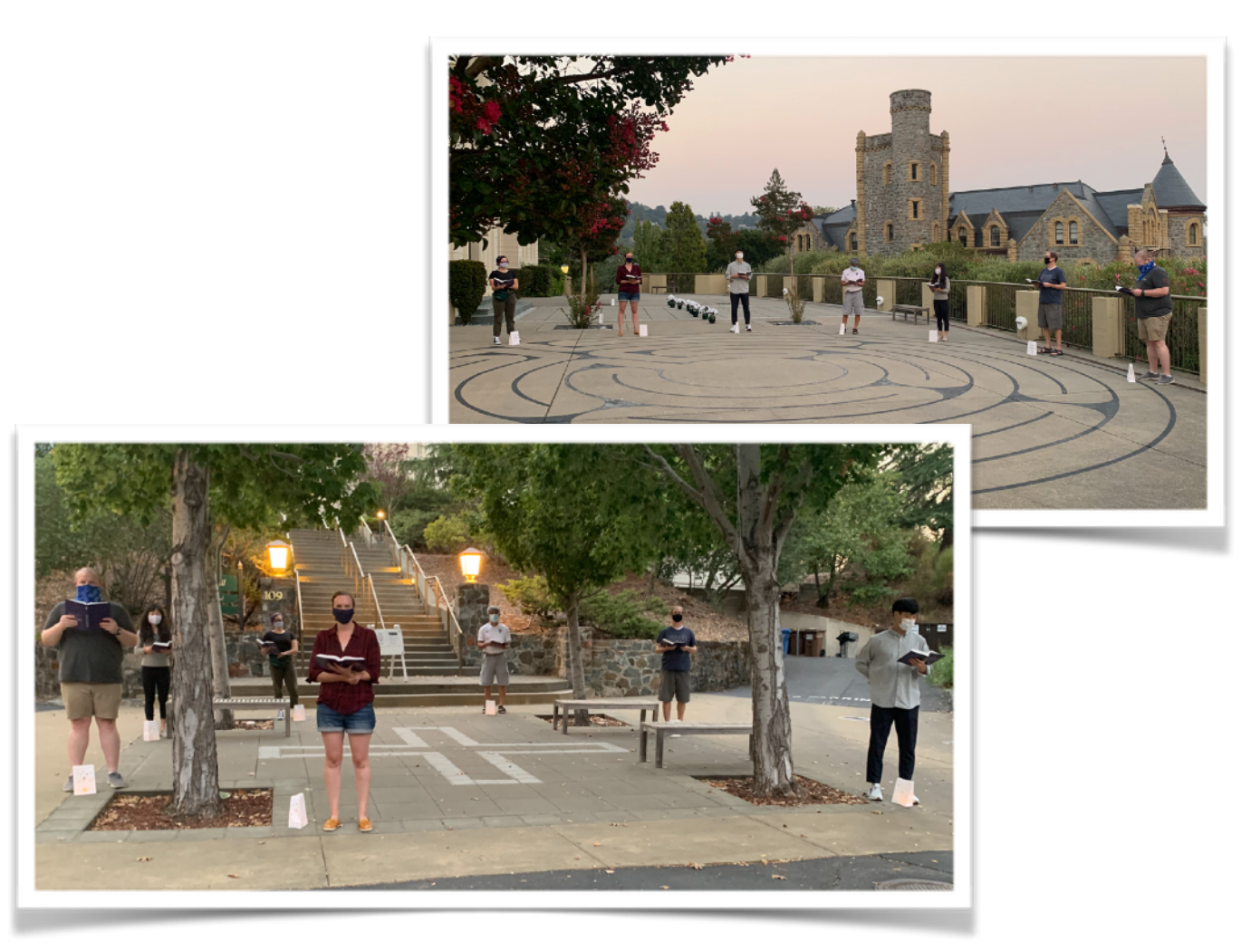
"Park" - Set up in an open common area in your town/city/community or at your church. Be sure there is enough space for safe distancing of the number of singers in your group. This "stationary" setting would be great for the longer 25-30 minute set.

In this example, the luminaria are supplemented with inexpensive silk poinsettias that are easy to use and transport, creating a safety barrier for the audience.