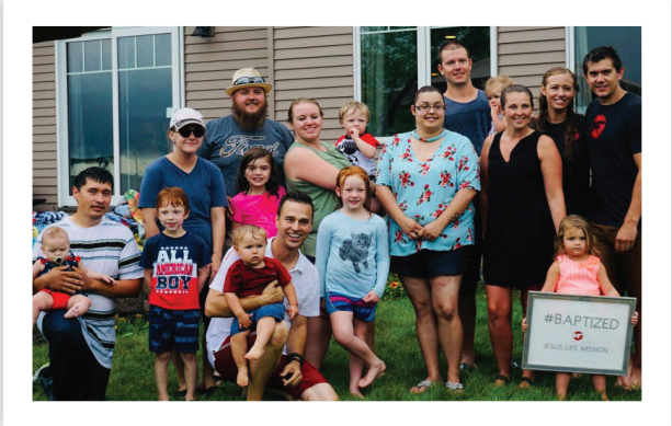
Seventeen people were batpized at the barbecue held by Mission Fargo.