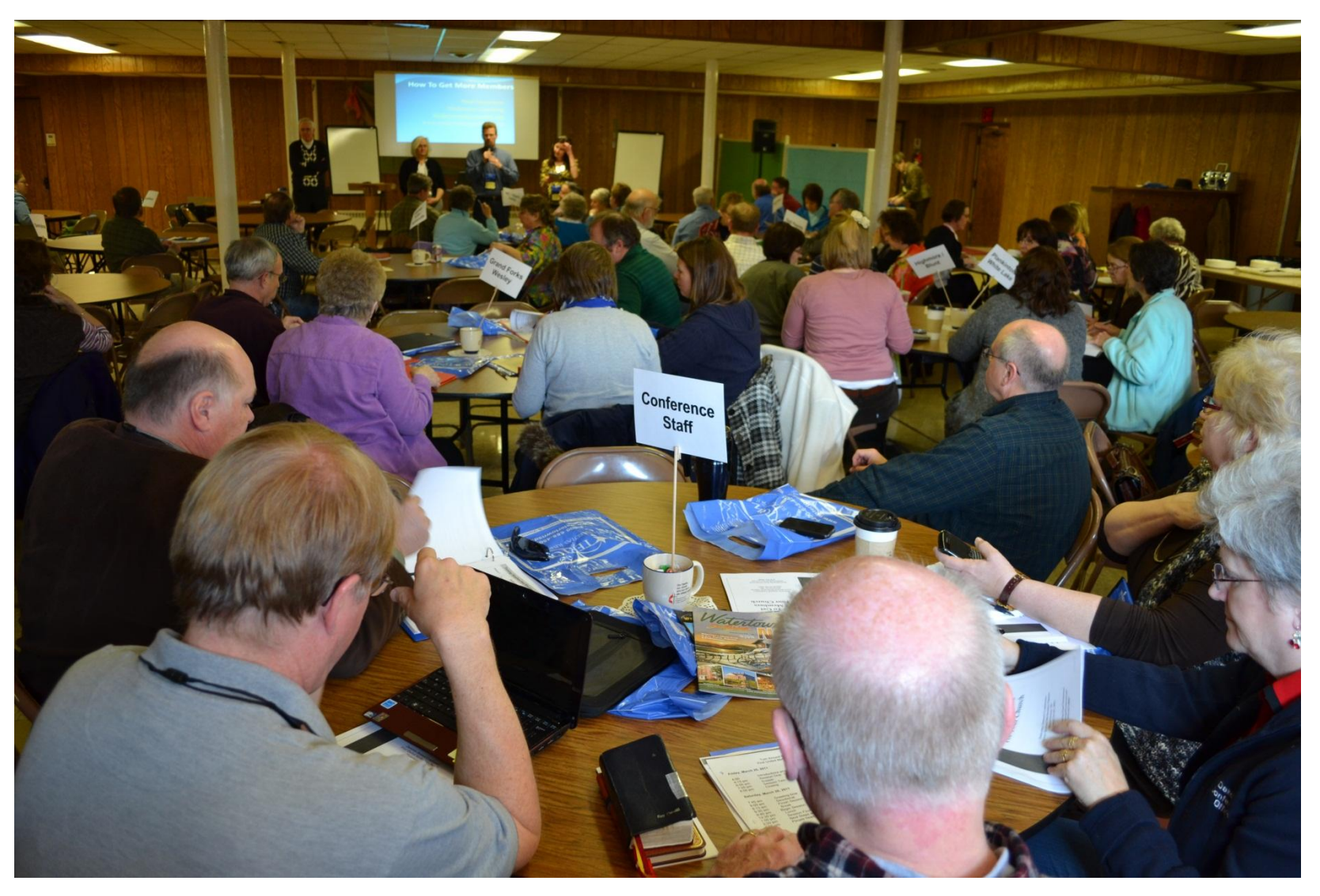
Co-Sponsored and Hosted by Watertown 1st UMC