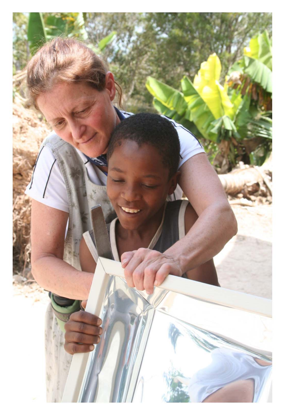
VOLUNTEERS In Mission demonstrate Christian Love In Action!