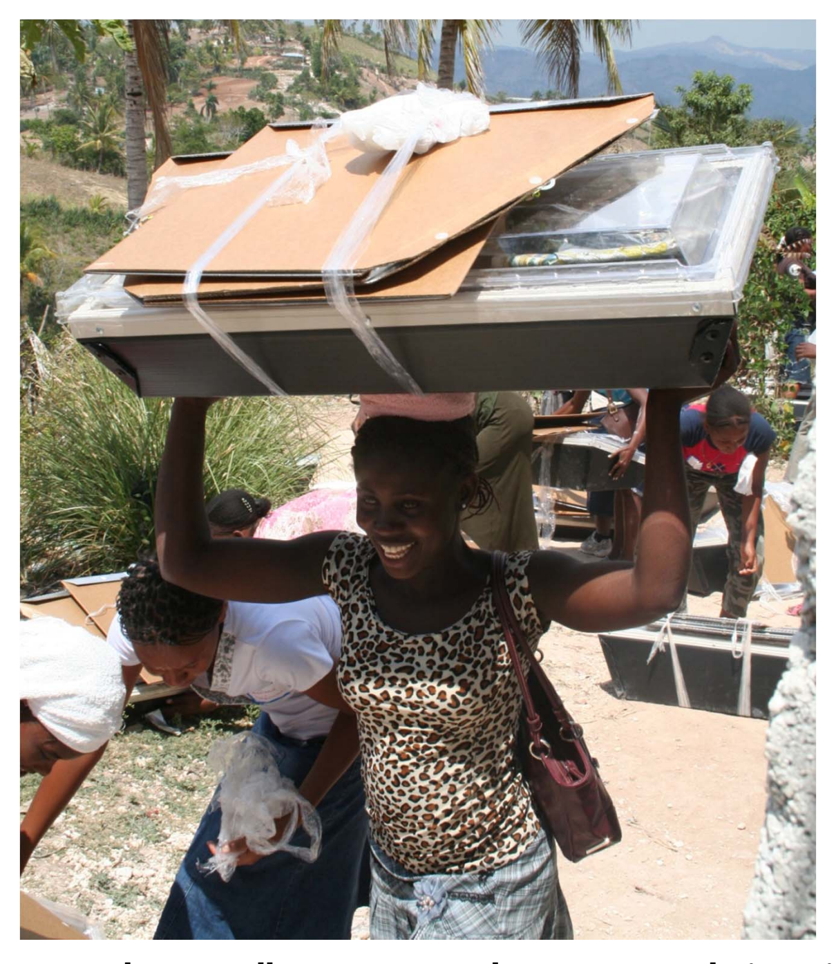
GRADUATION: there really are no words to express their satisfaction.