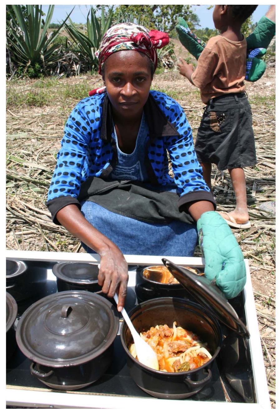
EDUCATION is JOB #1: Offering cooking instruction using the free energy of the sun.