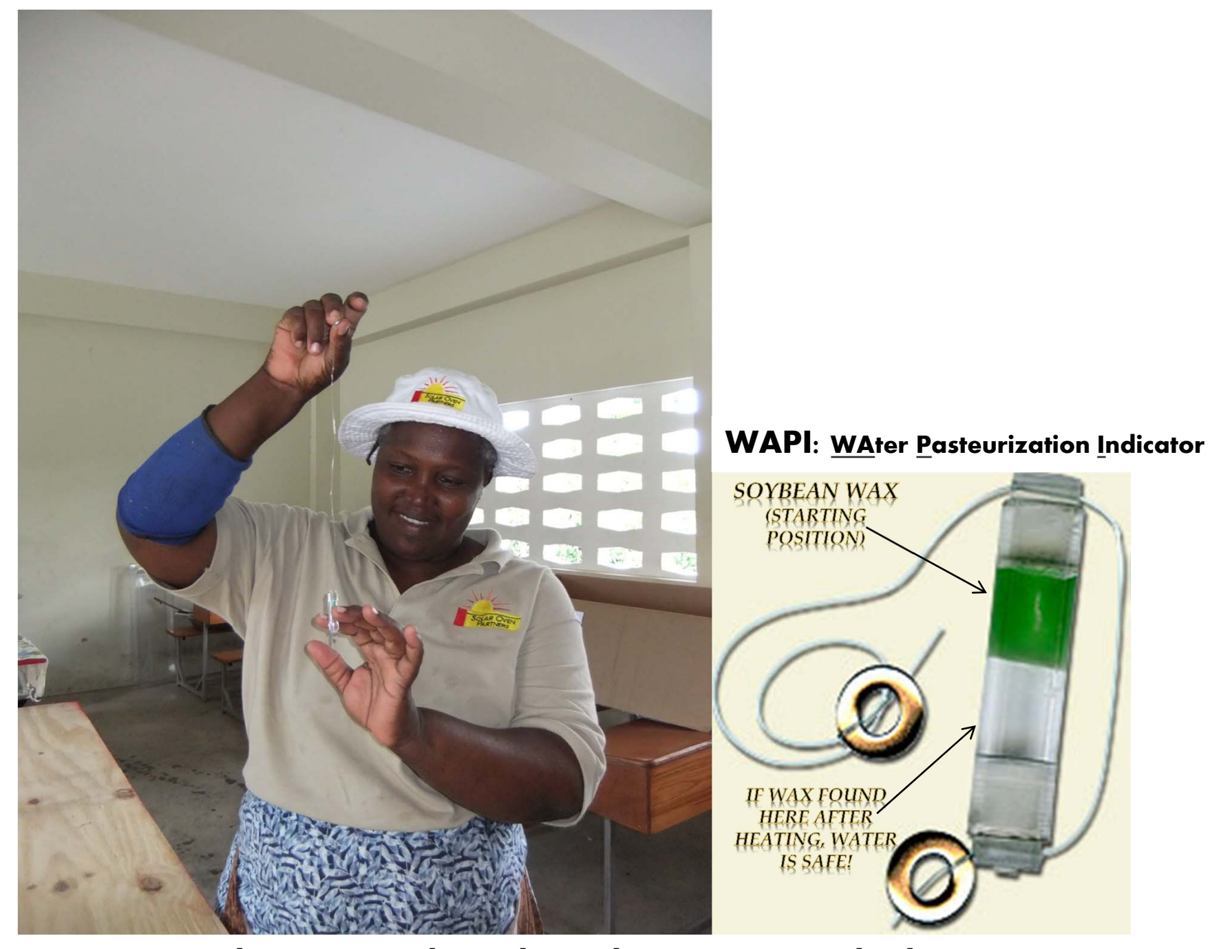
LEARNING about saving lives through pasteurizing drinking water.