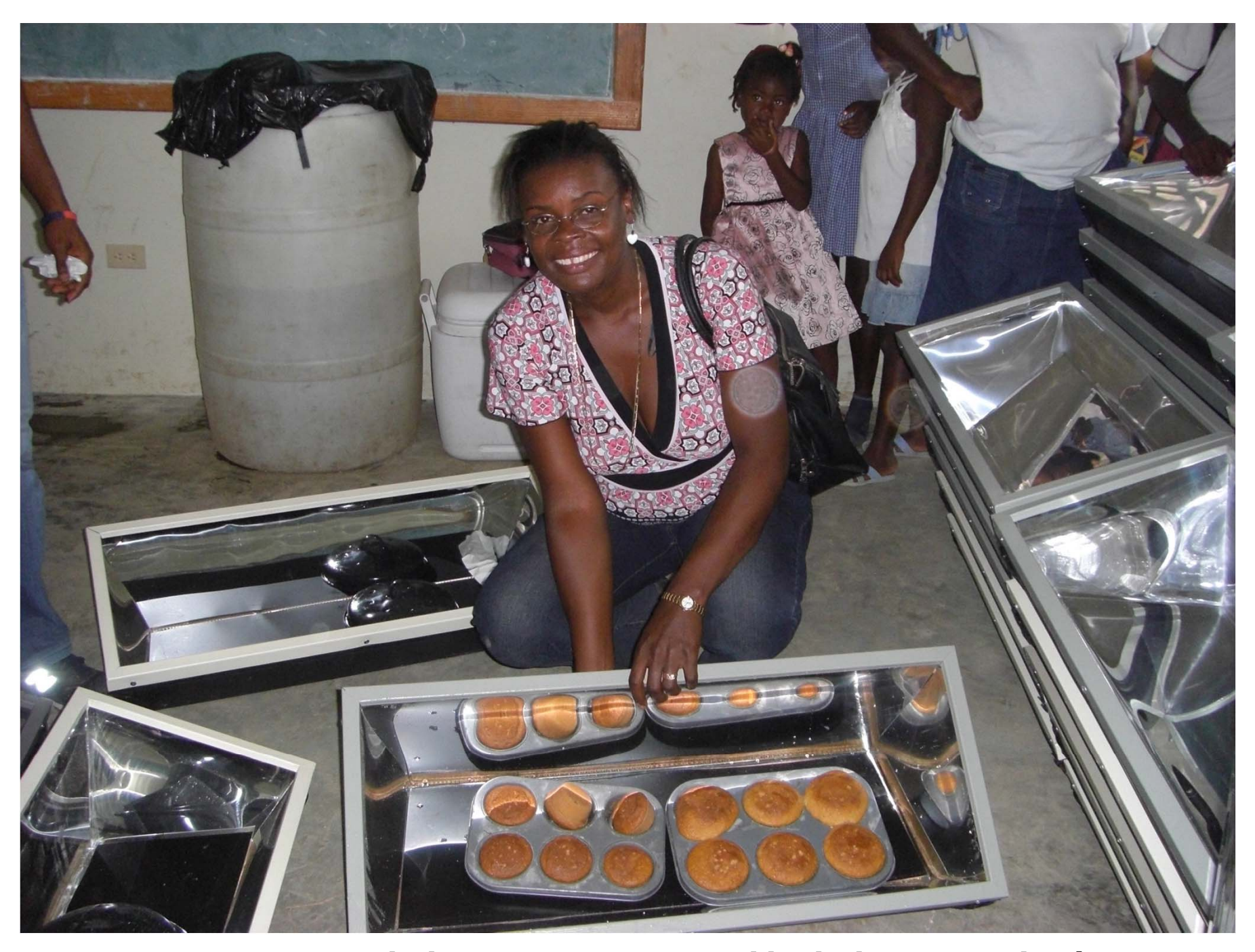
TRAINING includes new experiences like baking cupcakes!